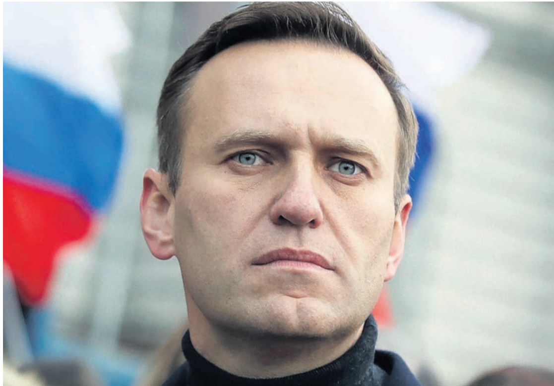
Russian opposition activist Alexei Navalny takes part in a march in memory of opposition leader Boris Nemtsov in Moscow, Russia on Feb. 29, 2020.